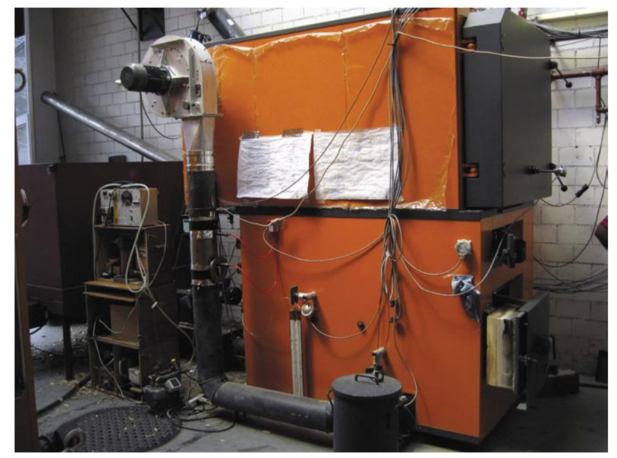
Fig. 1: Boiler prototype with two-stage combustion applying flue gas recirculation (FGR) with 240 kW nominal heat output.

It could be shown that a significant reduction of physiologically relevant PM0.6 emissions as well as the total particle emissions