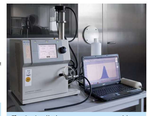
Fig. 3: Applied measurement assembly