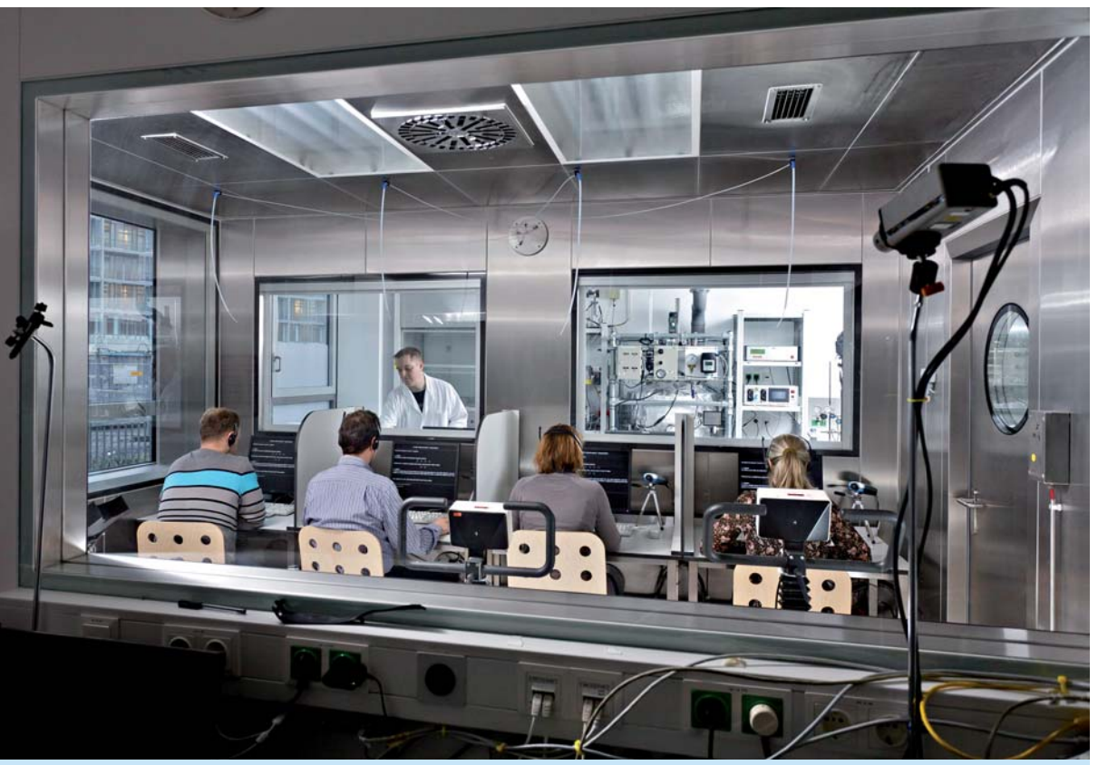
Fig. 1: View into the ExpoLab with four subjects

To assess the distribution of particles in the chamber we chose ultra fine carbon black particles. These particles were generated by an electric arc discharge system (GFG 3000, Palas GmbH, Germany) between two consumable carbon electrodes in an argon gas environment (flow: 5.0 l/min.) with added oxygen (air flow: 10.0 l/min.). The highly concentradted partikels where mixed with the complete air stream of the air conditioner (air flow: 360 m<sup>3</sup>/h). An electrostatic classifier (SMPS, model 3080, TSI Inc., USA) coupled with a condensation particle counter (CPC, model 3010, TSI Inc., USA) was used to characterize the particles and the inhomogeneity of distribution. This system detects particles in the range of 10 to 430 nm and was installed on a mobile table in the exposure chamber, shown in figure 3. The number concentration and the sizes distributions were determined point by point (0.50 m * 0.50 m) in a height of 1.20m, representative for the height of subject's faces during sitting in the chamber. The profile of the measurement-scheme is shown in figure 4.