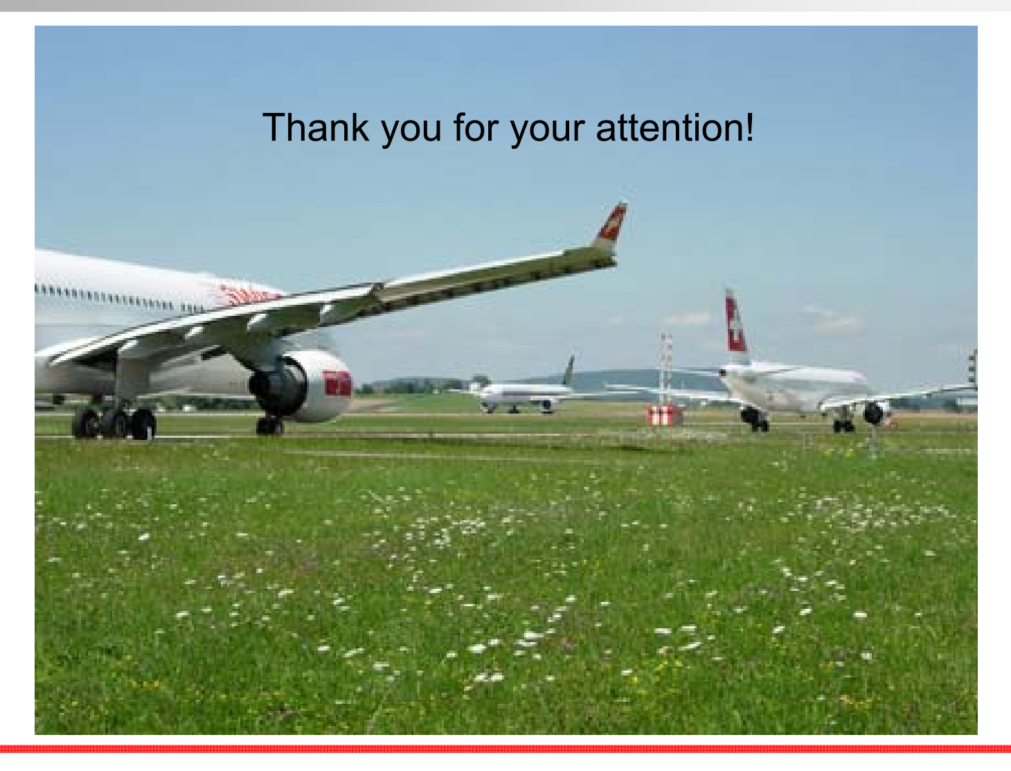
17<sup>th</sup> ETH Conference on Combustion Generated Nanoparticles, 25<sup>th</sup> June 2013, Theo Rindlisbacher