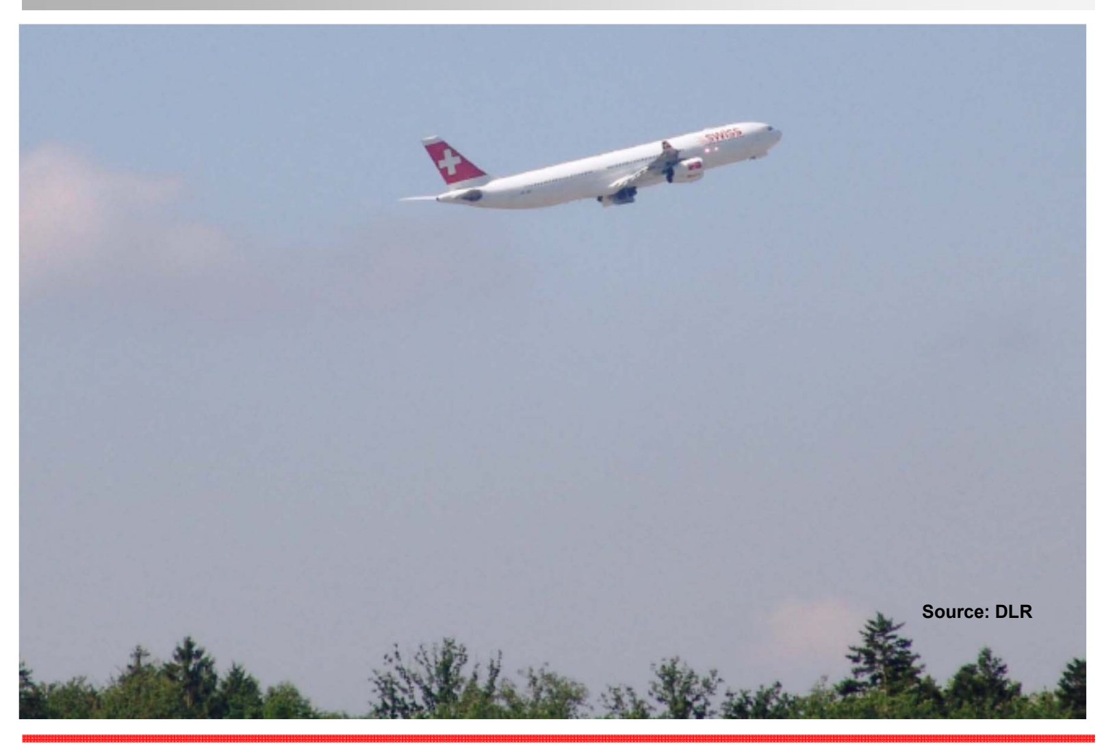
17th ETH Conference on Combustion Generated Nanoparticles, 25th June 2013, Theo Rindlisbacher