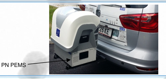
Figure 1: Installation of the AVL PN and Gas PEMS iS on the trailer hook of a passenger car.

We present in this work the development of a PN-PEMS device (figure 1) based on diffusion charging. The operating principle of the sensor is based on the measurement of induced currents produced by modulating the charge state of the particles [3]. This enables a real-time determination of electrometer zero levels, thus allowing for reliable measurements even at levels close to the instrument noise. Different approaches can be employed for the production of the space-charge pulses, allowing for an unparalleled control of the raw signal dependence on particle size (figure 2). A better than \pm 15\% correlation against a reference, CPC-based, instrumentation can thus be established over a wide size range (geometric mean diameters in the 30 to 120 nm range), without the need for inversion algorithms and assumptions on the form of the underlying size distribution.