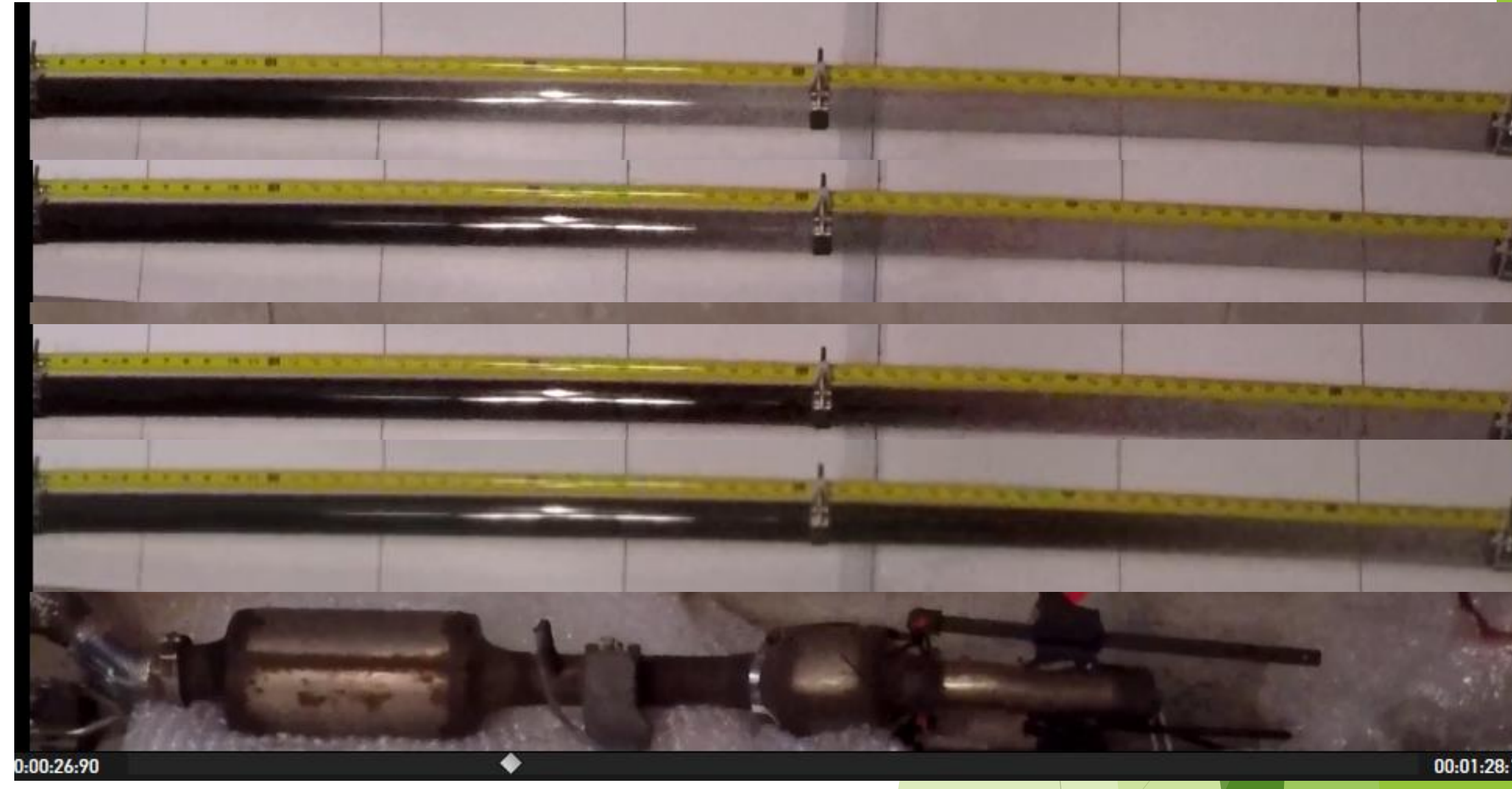
CPR Bench Test with Full System - sequential frames Regeneration @ 240 Frames/sec >160 km/hr Regeneration Exit Velocity

10.4 Liter Storage Tank Packaged within Front Fender